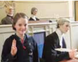
An increased number of girls have enjoyed Sleepovers, Brownie or Guide Residential, Camps and international experiences. Thank you again to leaders for organising and supporting such a variety of opportunities.