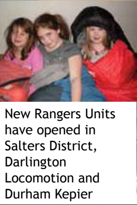
New Rangers Units have opened in Salters District, Darlington Locomotion and Durham Kepier