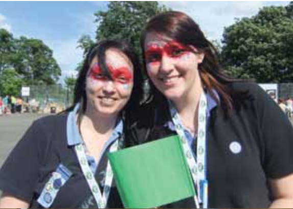
A further 18 girls trained to become Peer Educators have been out and about in the County delivering to units on topics such as Bullying, Self Awareness, Communication, Media etc.