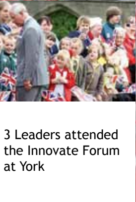
3 Leaders attended the Innovate Forum at York