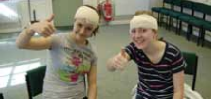
83 Leaders have attended First Response Training