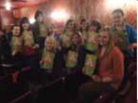
Guiding has been profiled at community events, e.g. Seaham and Darlington Carnival, The Vibe Awards for young people, on the Olympic Torch route, Activate at South Shields