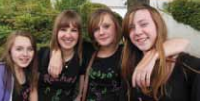
Hundreds of Guides from the County attended the Big Gigs in June and October