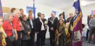
30 Guides have undertaken their Baden Powell Adventure Challenge, thanks to all those who have organised these within the County