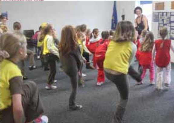
The County has provided a more flexible programme of training inclusive of Sectional, Need an Idea (CHAT), Holiday and Camping, First Response, Food Safety, Together We Can, Crafts for all Seasons, Winter Fest, Commissioner and Adviser Team Day, and County held a 'Right Royal Weekend of Training' at Netherurd