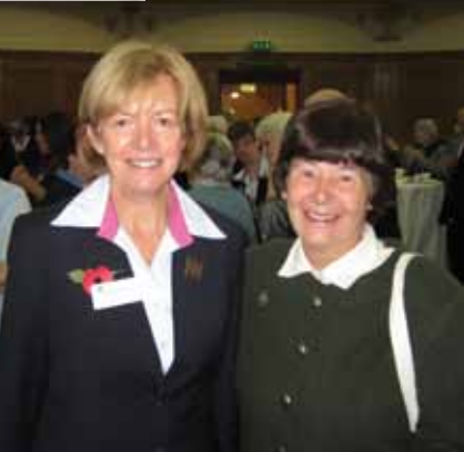
We celebrated the 50th Anniversary of Camp House with a joint Strawberry Evening with Durham North